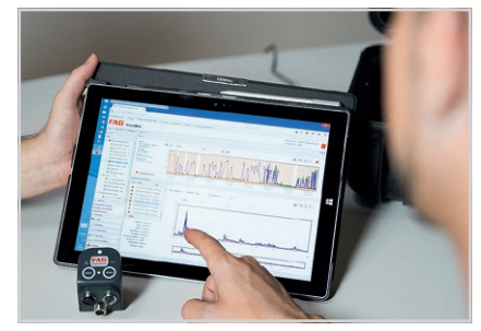
Data analysis with FAG SmartWeb