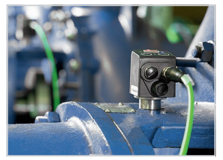
FAG SmartCheck in use on a pump